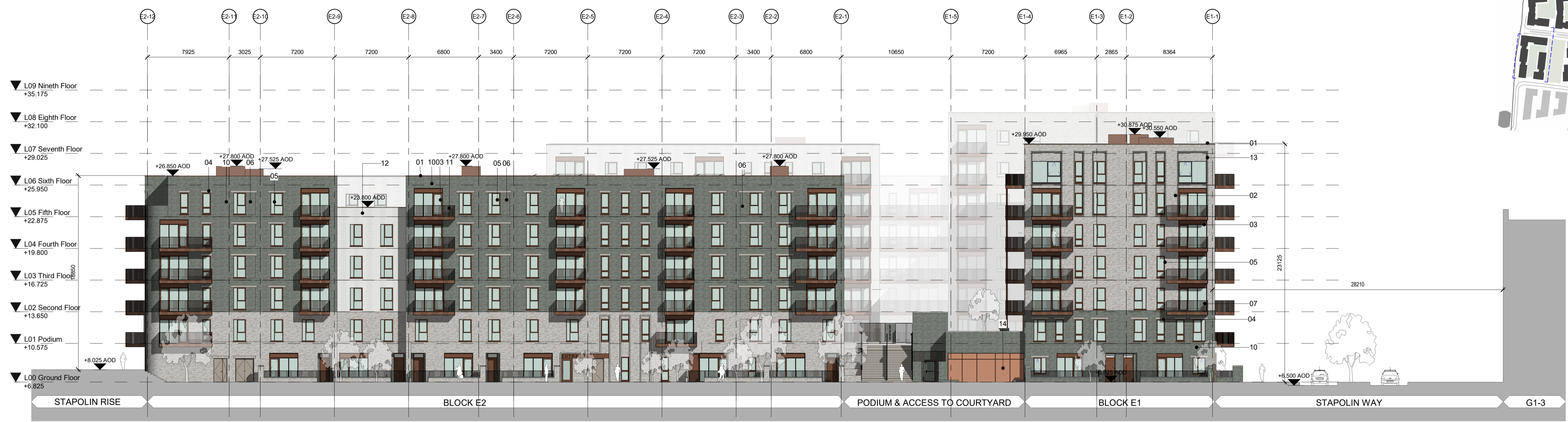
1 BLOCK E1/2 EAST ELEVATION 1 : 200